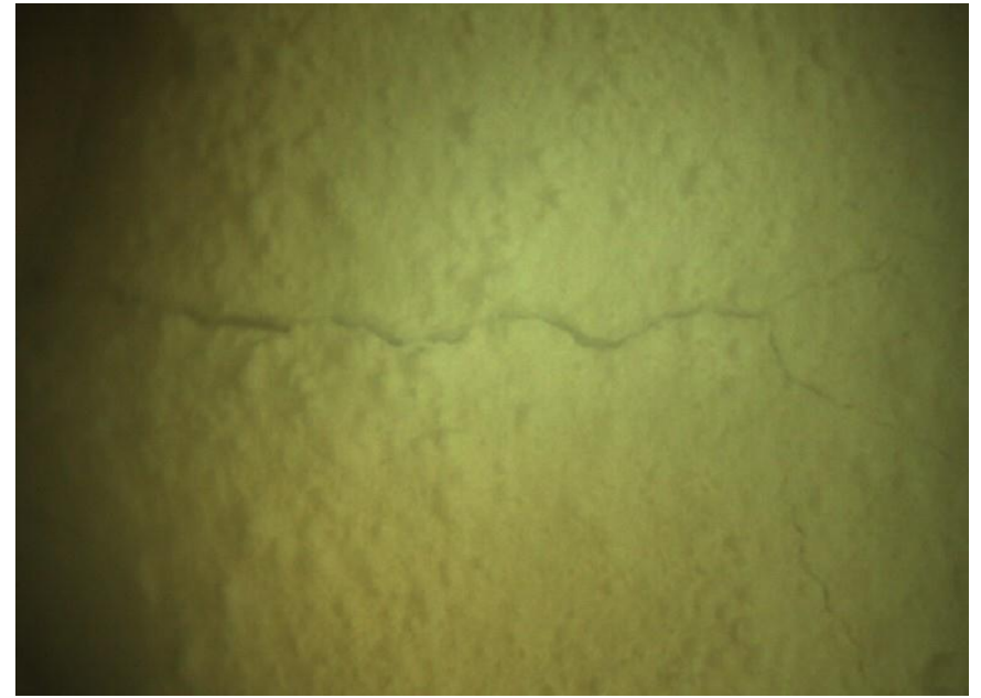
Scandia substituted zirconia sample